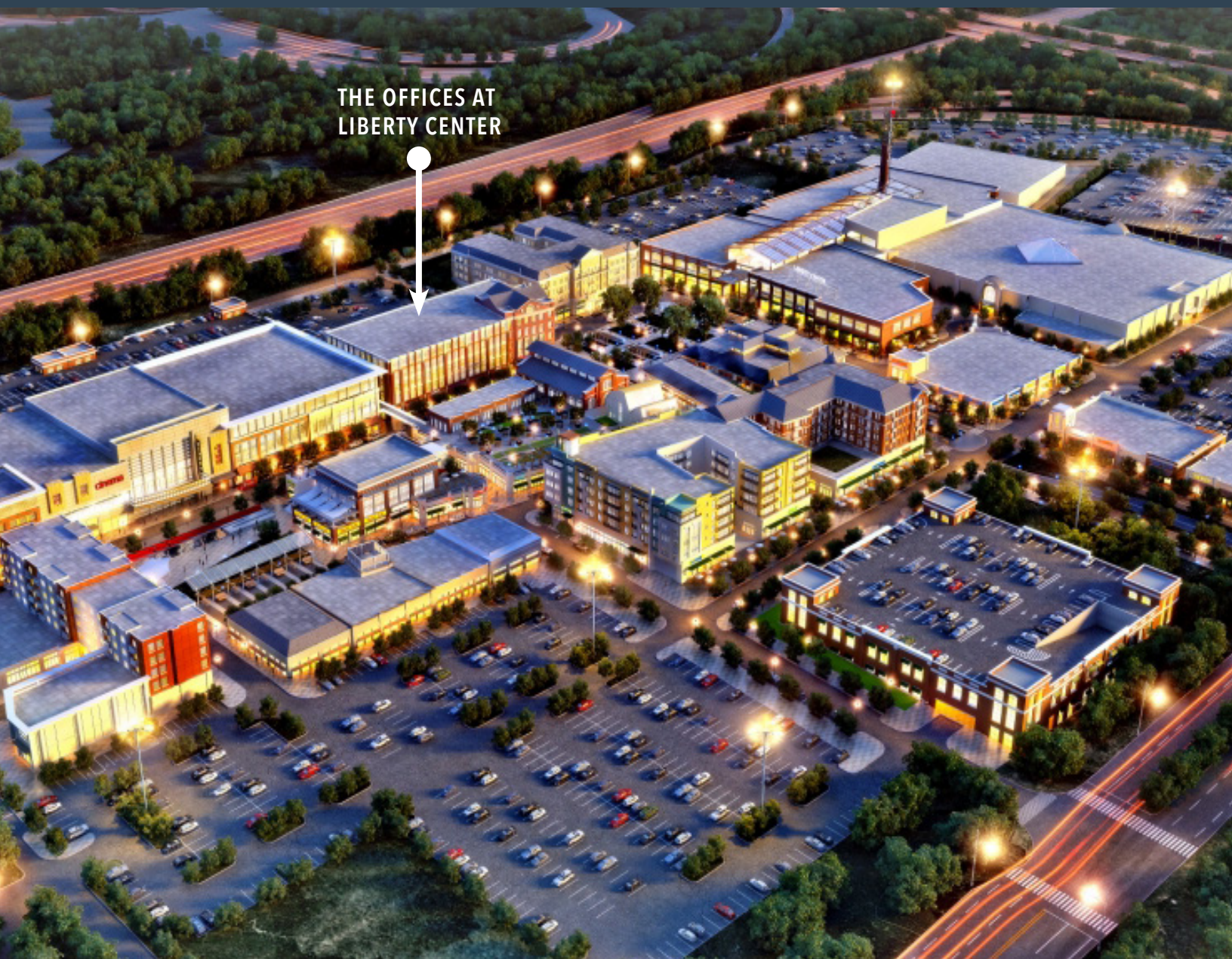
THE OFFICES AT LIBERTY CENTER

For additional information, please contact: